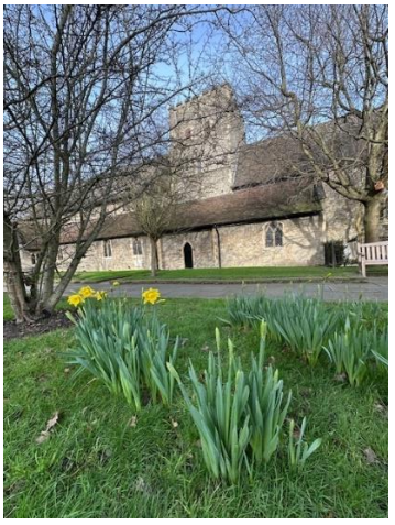
The first daffodils of spring

8pm Choral Eucharist with imposition of ashes