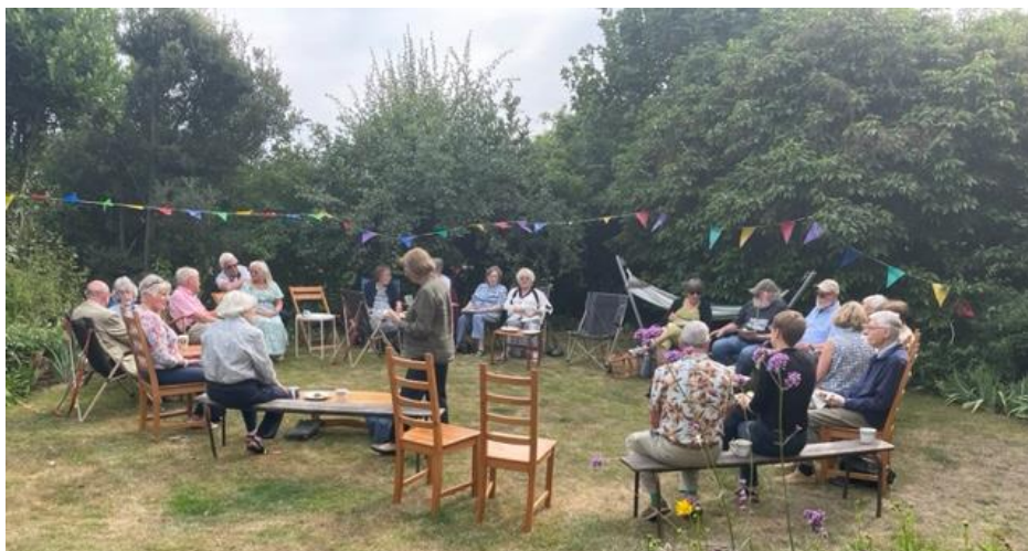
And the Teddy Bears had their picnic too!